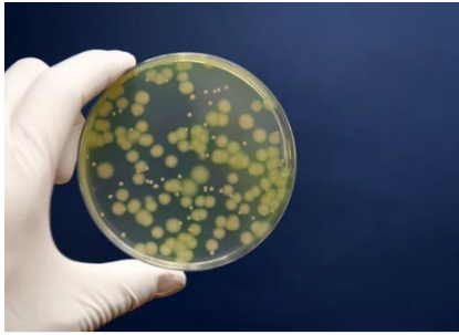
Pseudomonas pneumonia and septicemia