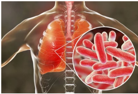
Legionnaires' Disease Legionella spp.